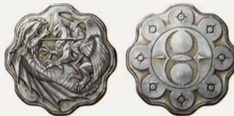
SUN PLATINUM COIN, TWICE AS LARGE AS A NIB (1 SUN = 1,000 NIBS)