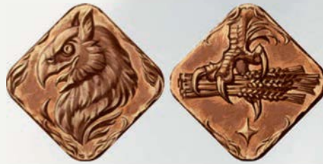
NIB COPPER COIN ABOUT THE SIZE OF A THUMBNAIL (1 NIB = 1 COMMON COPPER COIN)

HERE ARE IMAGES OF THE CITY'S COINS, WHICH AREN'T TO SCALE.