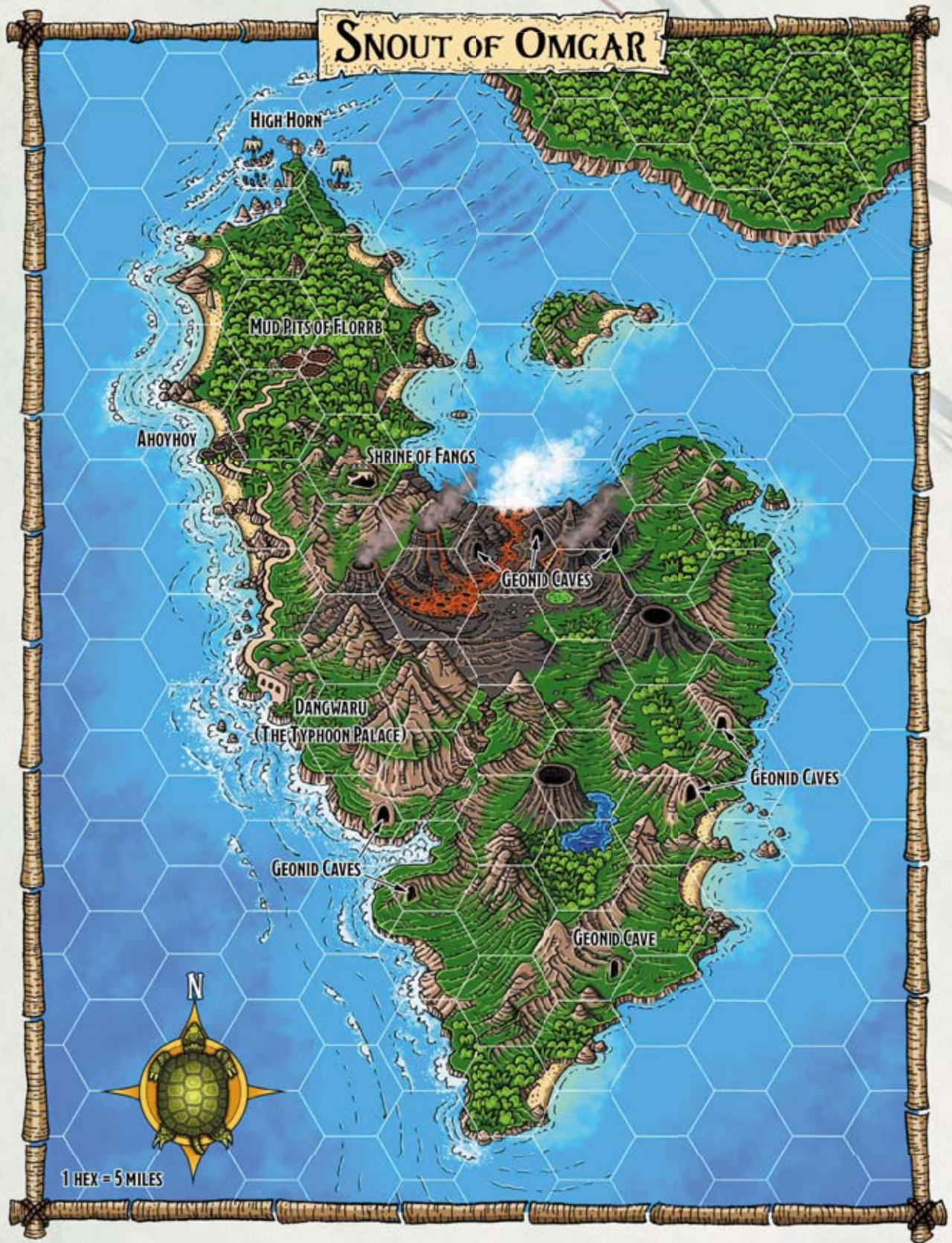
MAP 1: SNOUT OF OMGAR